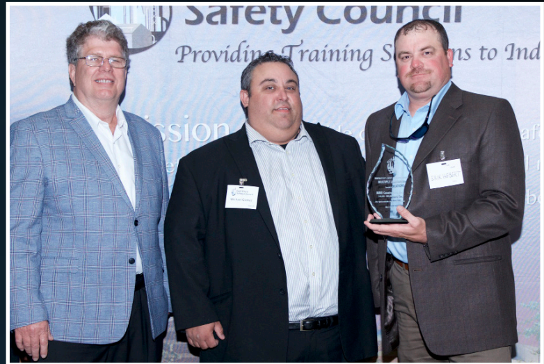
MMR CONSTRUCTORS, INC.

MULTIPLE LOCATIONS WINNERS LESS THAN 100,000 W-H