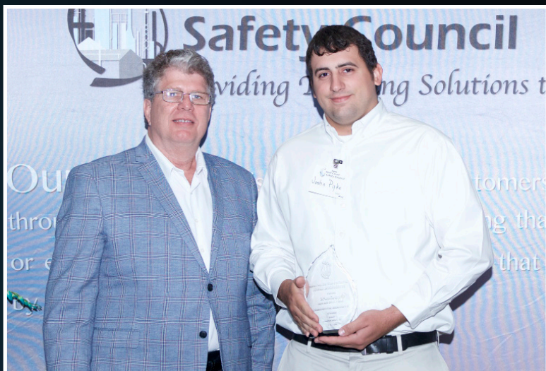
HYDROCHEM PSC VALERO ST. CHARLES REFINERY

ENVIRONMENTAL SERVICES 2,000 - 10,000 W-H