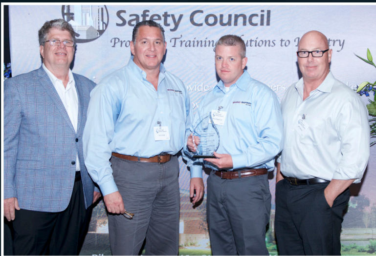
BRANDSAFWAY SOLUTIONS CHALMETTE REFINING, LLC

SPECIALTY CONTRACTORS 100,000 - 250,000 W-H