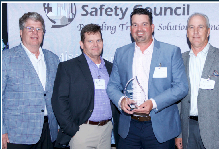
ZACHRY INDUSTRIAL, INC MONSANTO COMPANY

MECHANICAL CONTRACTOR 250,000 - 500,000 W-H