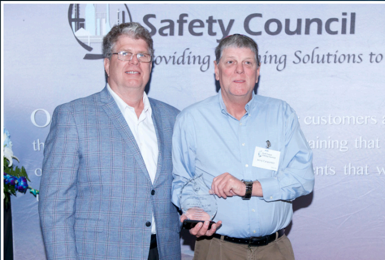
TNT CRANE & RIGGING, INC DOW CHEMICAL - ST. CHARLES

CRANE, RIGGING, & LIFTING SUPPORT SERVICES 10,000 - 25,000 W-H