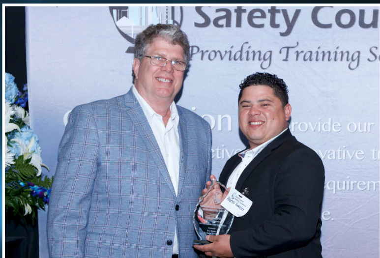
HYDROCHEM PSC DOW CHEMICAL - ST. CHARLES

ENVIRONMENTAL SERVICES 25,000 - 50,000 W-H