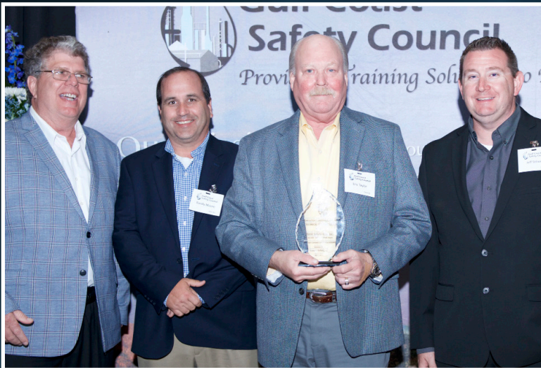
TOTAL SAFETY U.S., INC. CHALMETTE REFINING, LLC

TECHNICAL SUPPORT SERVICES 25,000 - 50,000 W-H