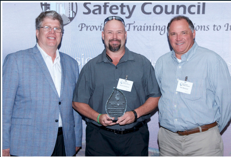
CIVIL CONSTRUCTION CONTRACTORS, LLC

MULTIPLE LOCATIONS WINNERS LESS THAN 100,000 W-H