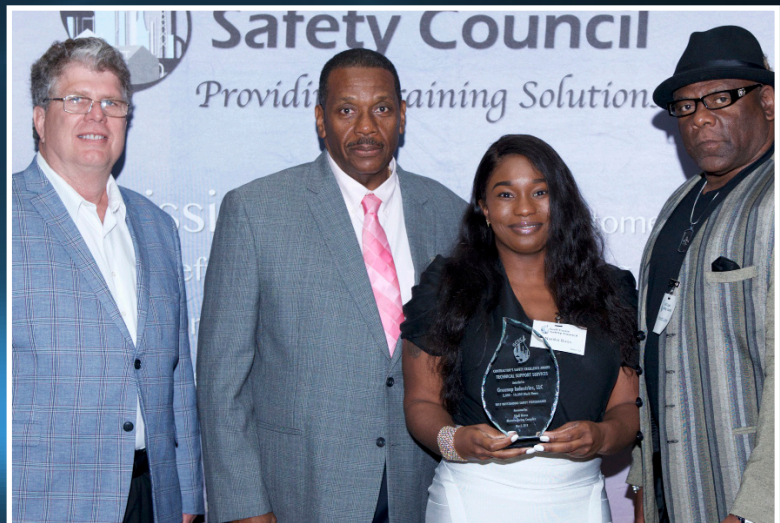
GREENUP INDUSTRIES, LLC SHELL NORCO MANUFACTURING COMPLEX

SPECIALTY CONTRACTORS 500,000 - 750,000 W-H