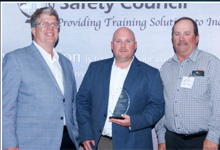
ICC - APACHE INDUSTRIAL SERVICES INC DOW CHEMICAL - ST. CHARLES

SPECIALTY CONTRACTORS 10,000 - 25,000 W-H