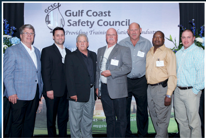
TURNER INDUSTRIES GROUP, LLC SHELL NORCO MANUFACTURING COMPLEX

MECHANICAL CONTRACTOR 500,000 - 750,000 W-H