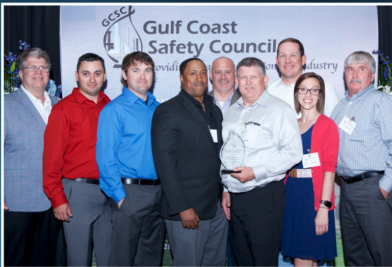
BROCK SERVICES, LLC

MULTIPLE LOCATIONS WINNERS 100,000 - 500,000 W-H