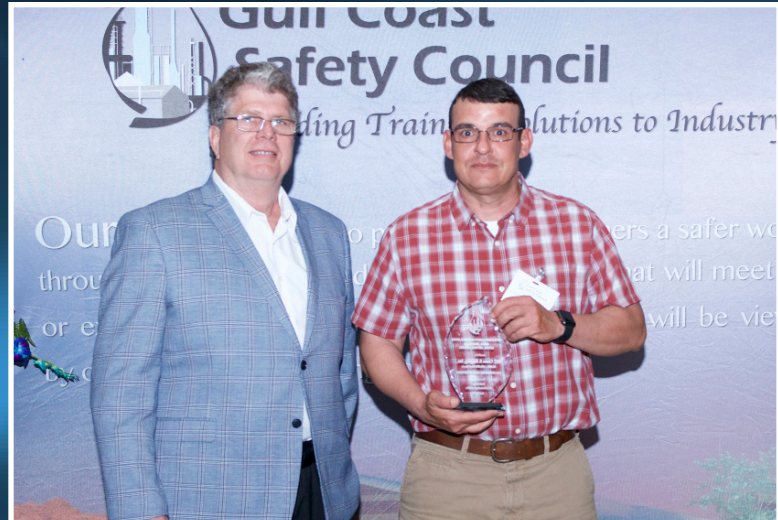
TNT CRANE & RIGGING, INC SHELL NORCO MANUFACTURING COMPLEX

CRANE, RIGGING, & LIFTING SUPPORT SERVICES 25,000 - 50,000 W-H