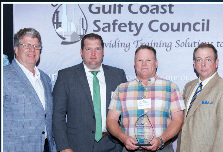
JVIC (A ZACHARY GROUP COMPANY) DOW CHEMICAL - ST. CHARLES

MECHANICAL CONTRACTOR 10,000 - 25,000 W-H