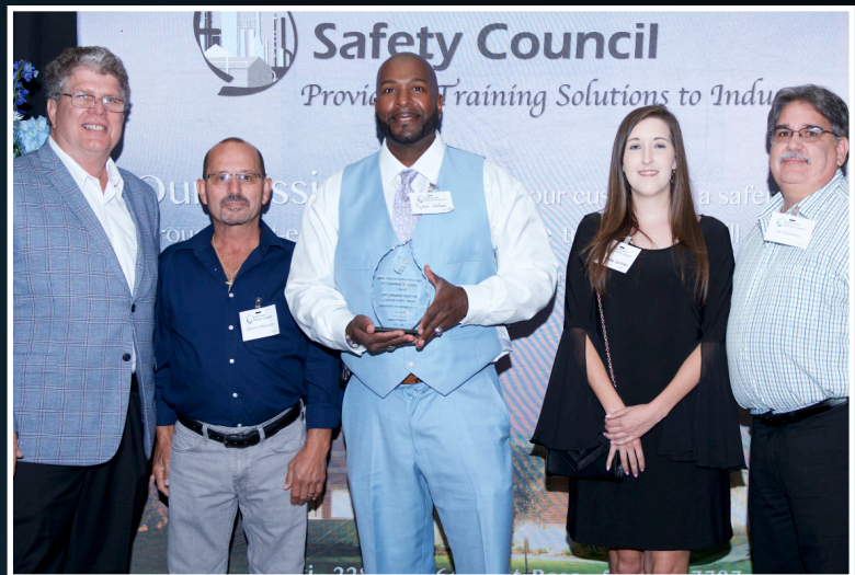
THE CAJUN COMPANY, INC. DOW CHEMICAL - ST. CHARLES

SPECIALTY CONTRACTORS 100,000 - 250,000 W-H