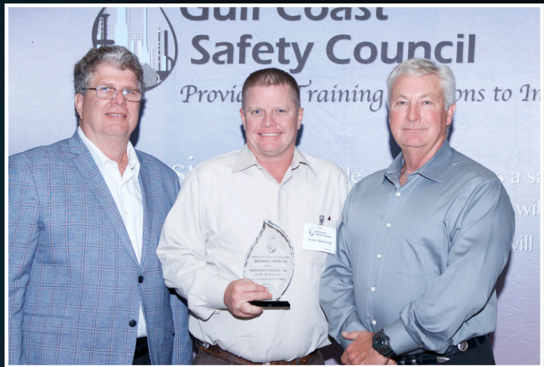
PERFORMANCE CONTRACTORS, INC CHEVRON PRODUCTS PASCAGOULA

MECHANICAL CONTRACTOR 100,000 - 250,000 W-H