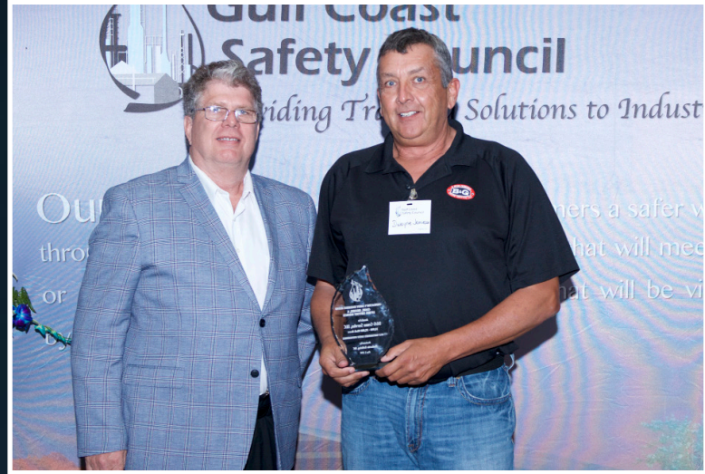
B&G CRANE SERVICE, LLC CHALMETTE REFINING, LLC

CRANE, RIGGING, & LIFTING SUPPORT SERVICES 2,000 - 10,000 W-H