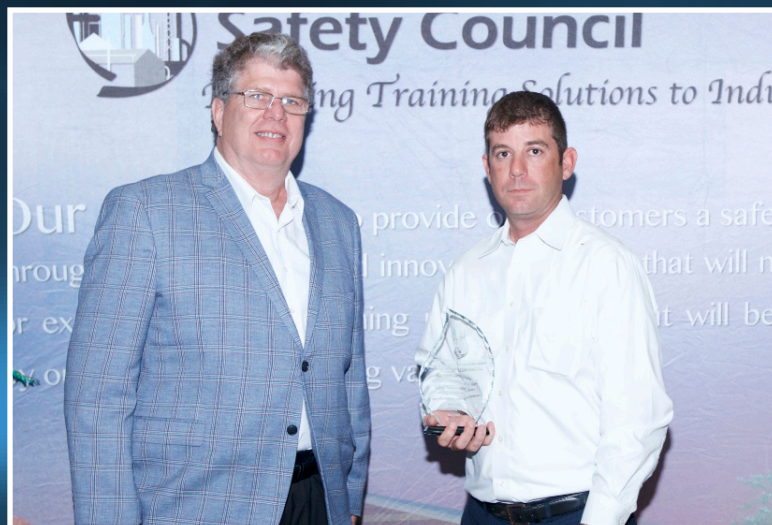
CAJUN CONSTRUCTORS, LLC SHELL NORCO MANUFACTURING COMPLEX

MECHANICAL CONTRACTOR 25,000 - 50,000 W-H