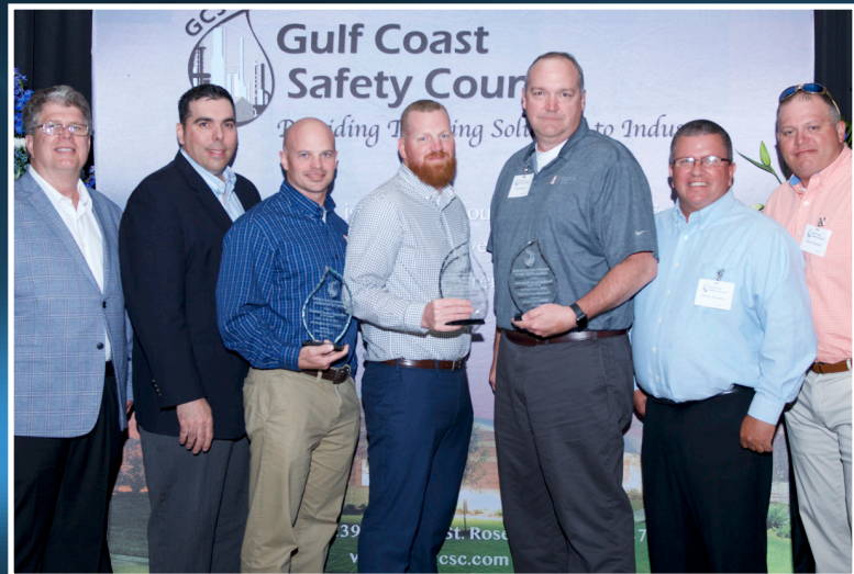
PETROLEUM SERVICE CORPORATION AN SGS COMPANY MARATHON PETROLEUM CORP.

TECHNICAL SUPPORT SERVICES 50,000 - 100,000 W-H