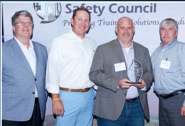
BROCK SERVICES, LLC CHEVRON PRODUCTS PASCAGOULA

SPECIALTY CONTRACTORS 250,000 - 500,000 W-H