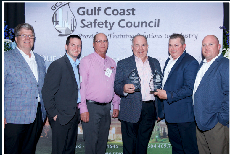
APACHE INDUSTRIAL SERVICES, INC MARATHON PETROLEUM CORP.

SPECIALTY CONTRACTORS 2,000 - 10,000 W-H