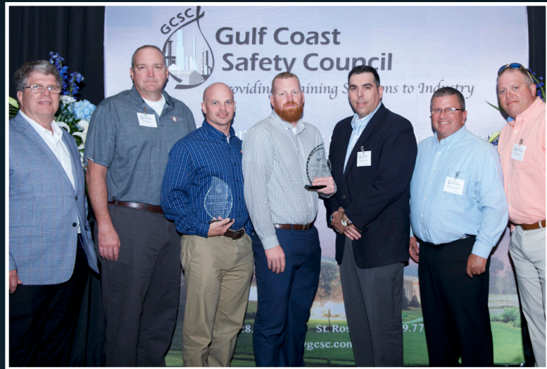
PETROLEUM SERVICE CORPORATION AN SGS COMPANY CHALMETTE REFINING, LLC

TECHNICAL SUPPORT SERVICES 10,000 - 25,000 W-H