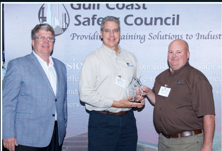
MATRIX SERVICE COMPANY MARATHON PETROLEUM CORP. COMPLEX

ENVIRONMENTAL SERVICES 2,000 - 10,000 W-H