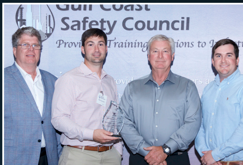
PERFORMANCE CONTRACTORS VALERO MERAUX REFINERY

ENVIRONMENTAL SERVICES 100,000 - 250,000 W-H