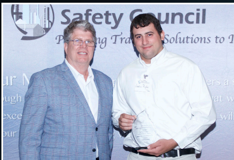
HYDROCHEM PSC CHALMETTE REFINING, LLC

ENVIRONMENTAL SERVICES 100,000 - 250,000 W-H