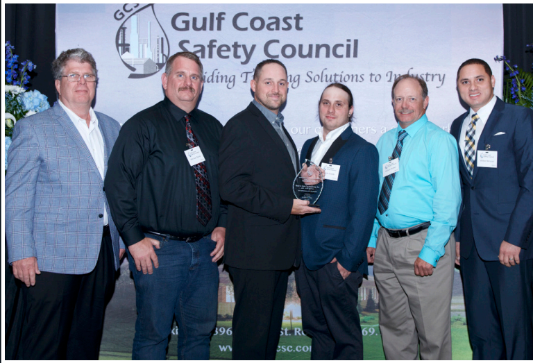
HOIST & CRANE SERVICE GROUP, INC DOW CHEMICAL - ST. CHARLES

CRANE, RIGGING, & LIFTING SUPPORT SERVICES 2,000 - 10,000 W-H