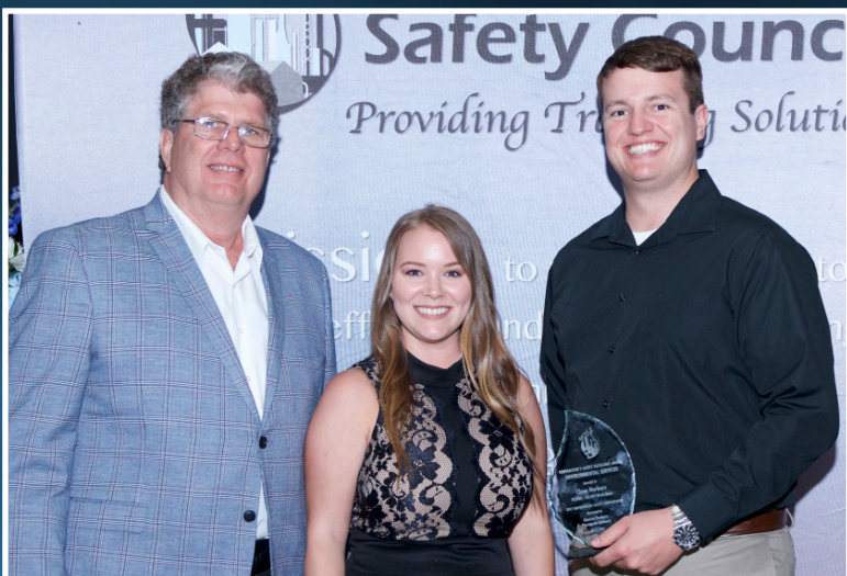
CLEAN HARBORS CHEVRON PRODUCTS PASCAGOULA

ENVIRONMENTAL SERVICES 10,000 - 25,000 W-H