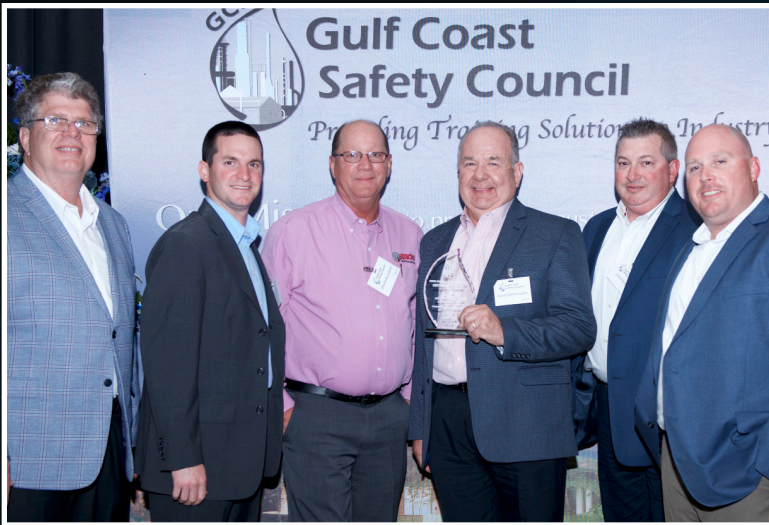
ICC - APACHE INDUSTRIAL SERVICES INC VALERO MERAUX REFINERY

SPECIALTY CONTRACTORS 2,000 - 10,000 W-H