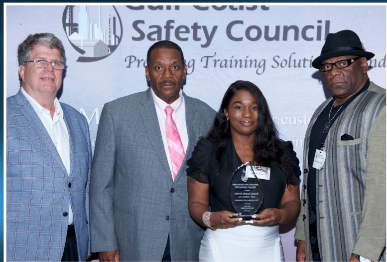
GREENUP SPECIALTY SERVICES SHELL NORCO MANUFACTURING COMPLEX

SPECIALTY CONTRACTORS 25,000 - 50,000 W-H