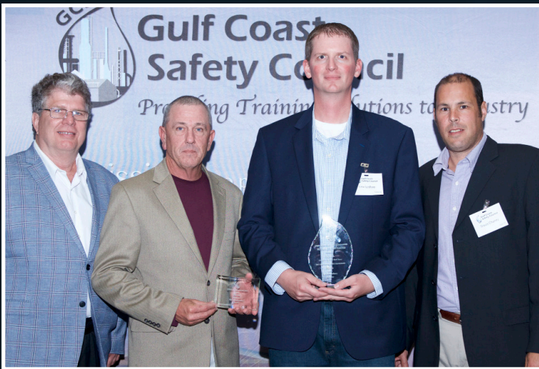
BAY LTD VALERO ST. CHARLES REFINERY

MECHANICAL CONTRACTOR 100,000 - 250,000 W-H