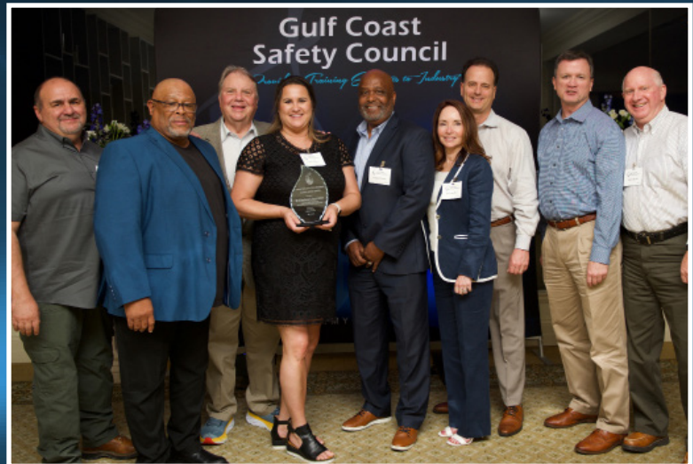
M S BENBOW & ASSOCIATES SHELL ENERGY & CHEMICALS PARK NORCO

SPECIALTY CONTRACTORS GREATER THAN 750,000 W-H