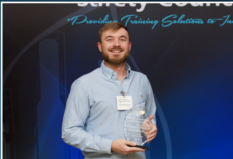
CIVIL CONSTRUCTION CONTRACTORS, LLC OCCIDENTAL CHEMICAL COMPANY

MECHANICAL CONTRACTORS LESS THAN 10,000 W-H