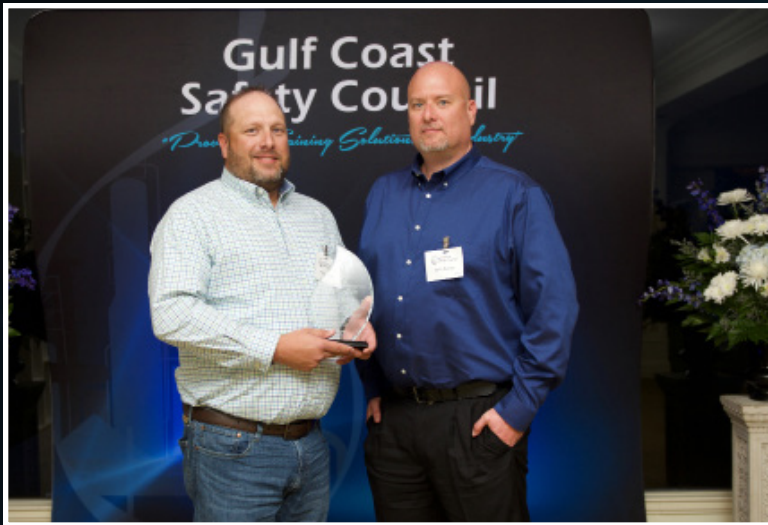
TURNER SPECIALTY SERVICES, LLC NON-DESTRUCTIVE TESTING DIVISION DOW CHEMICAL ST. CHARLES OPERATIONS

SPECIALTY CONTRACTORS 50,000 - 100,000 W-H