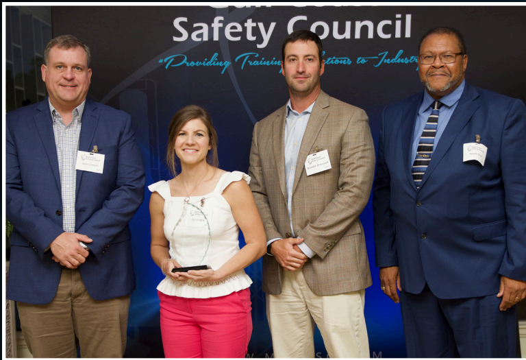
PERFORMANCE CONTRACTORS, INC. DOW CHEMICAL ST. CHARLES OPERATIONS

MECHANICAL CONTRACTORS 50,000 - 100,000 W-H