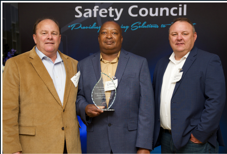
TURNER SPECIALTY SERVICES, LLC MECHANICAL DIVISION SHELL ENERGY & CHEMICALS PARK NORCO

ENVIRONMENTAL SERVICES 25,000 - 50,000 W-H