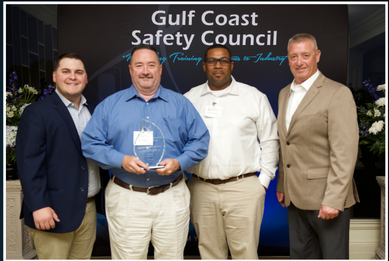
APACHE INDUSTRIAL SERVICES W. R. GRACE - SHAC

MECHANICAL CONTRACTORS GREATER THAN 750,000 W-H