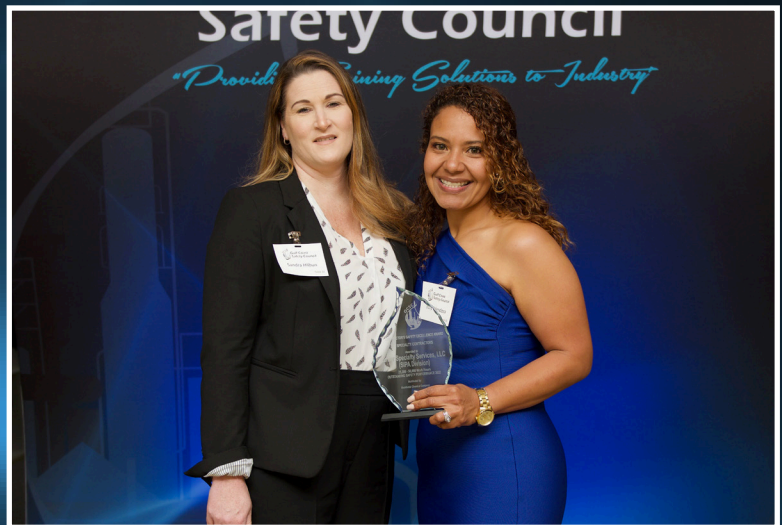
TURNER SPECIALTY SERVICES, LLC SIPA DIVISION OCCIDENTAL CHEMICAL COMPANY

SPECIALTY CONTRACTORS 10,000 - 25,000 W-H