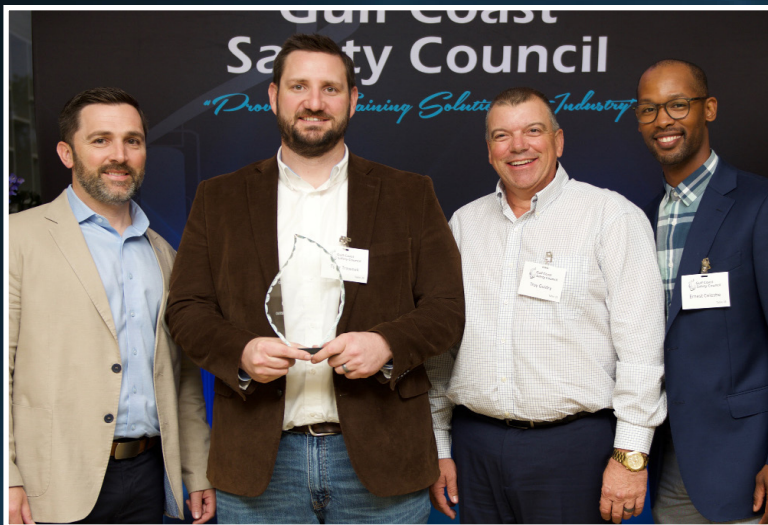
CONCO SERVICES, LLC DOW CHEMICAL ST. CHARLES OPERATIONS

CRANE, RIGGING, & LIFTING SUPPORT SERVICES 10,000 - 25,000 W-H