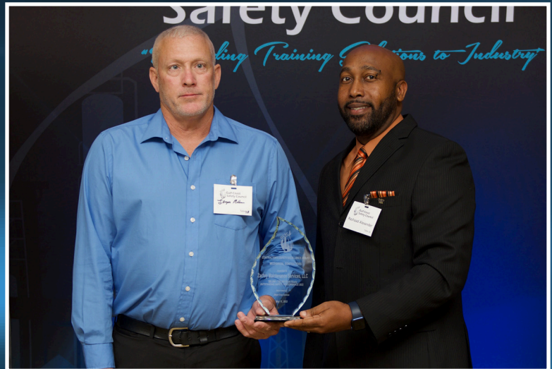
ZACHRY INDUSTRIAL, INC. BAYER CROP SCIENCE

MECHANICAL CONTRACTORS 250,000 - 500,000 W-H