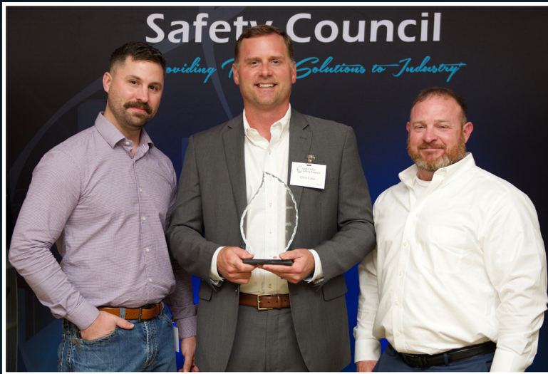
SPECIALTY WELDING AND TURNAROUNDS MARATHON PETROLEUM CORPORATION

MECHANICAL CONTRACTORS GREATER THAN 750,000 W-H