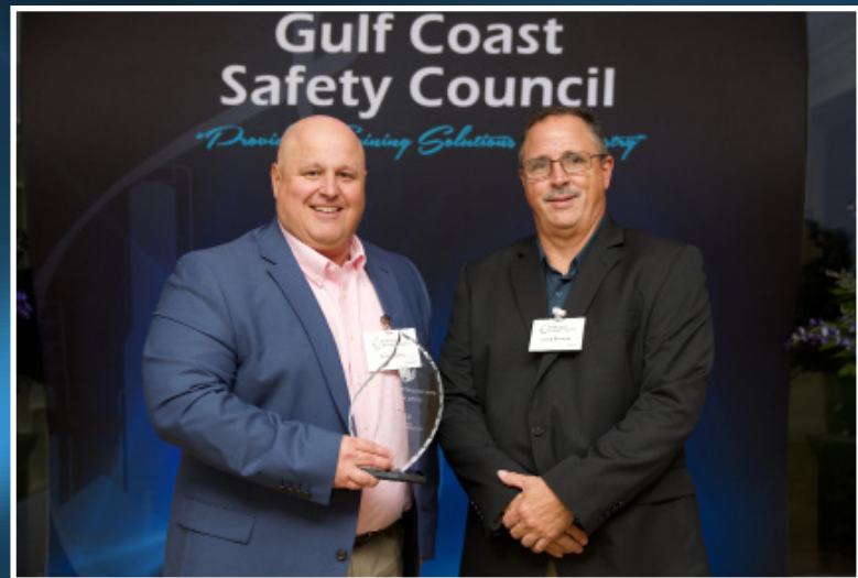
USES GROUP BAYER CROP SCIENCE

ENVIRONMENTAL SERVICES LESS THAN 10,000 W-H