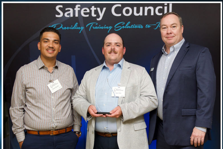
ZACHRY MAINTENANCE SERVICES, LLC VALERO MERAUX REFINERY

MECHANICAL CONTRACTORS 10,000 - 25,000 W-H