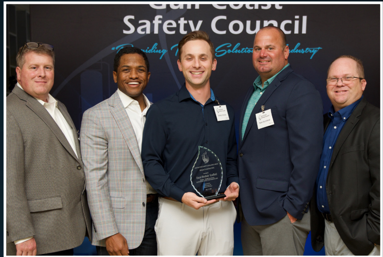
EXCEL MODULAR SCAFFOLD SHELL ENERGY & CHEMICALS PARK NORCO

SPECIALTY CONTRACTORS 50,000 - 100,000 W-H