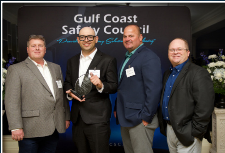
EXCEL MODULAR SCAFFOLD MARATHON PETROLEUM CORPORATION

SPECIALTY CONTRACTORS 500,000 - 750,000 W-H