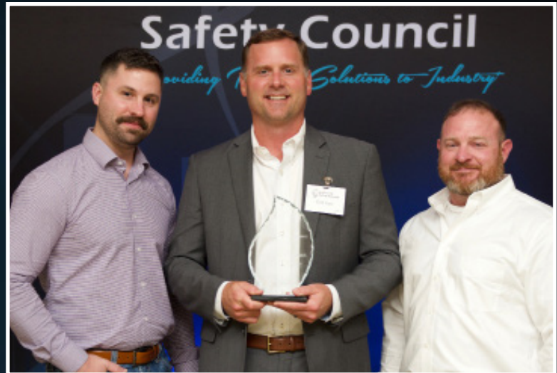
SPECIALTY WELDING AND TURNAROUNDS SHELL ENERGY & CHEMICALS PARK NORCO

ENVIRONMENTAL SERVICES 25,000 - 50,000 W-H