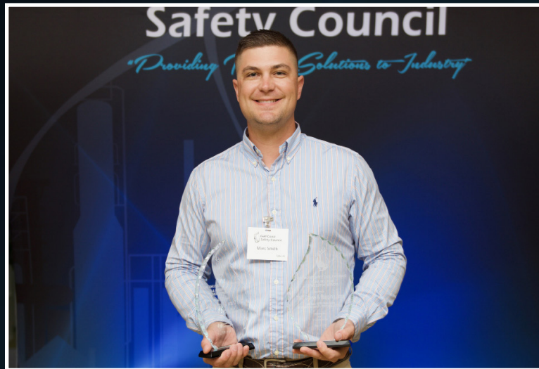
TNT CRANE & RIGGING, INC. VALERO ST. CHARLES REFINERY

CRANE, RIGGING, & LIFTING SUPPORT SERVICES LESS THAN 10,000 w-h