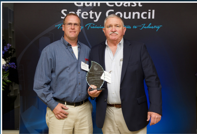
APACHE INDUSTRIAL SERVICES OCCIDENTAL CHEMICAL COMPANY

SPECIALTY CONTRACTORS LESS THAN 10,000 W-H