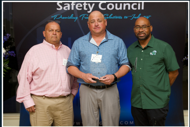
TURNER INDUSTRIES GROUP, LLC SWS & TURNAROUND DIVISION DOW CHEMICAL ST. CHARLES OPERATIONS

MECHANICAL CONTRACTORS 50,000 - 100,000 W-H